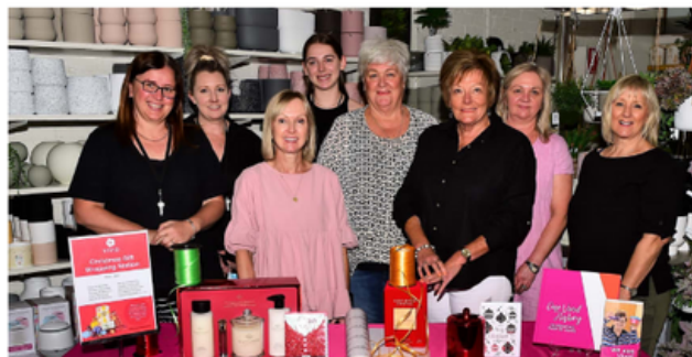
Christmas support: Vivid team members with staff from Under The Gable at the gift-wrapping table.

Vivid has partnered with Under the Gable to offer a gift-wrapping service for goods purchased in store.