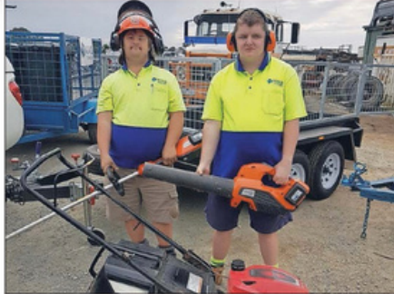
Hard yakka: VIVID participants with the equipment purchased with the grant.

people with an intellectual disability not only benefits the individual, it benefits the community too.